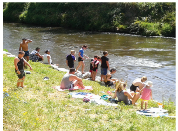
Residents and visitors to Otorohanga enjoying the river access picnic area on the banks of the Waipa River. The Authority funded project has also included work to improve the river's water quality.

The project is part of a wider initiative close to the town funded by the Waikato River Authority to improve the water quality entering the Waipa River, provide for eel passage and also improve recreational access to the river. The old Waipa River bed that runs through the centre of Otorohanga adjacent to Lake Huiputea has had a wetland built along the southernmost stretch. Riverside access to the Waipa River has been improved allowing kayakers and swimmers easy access to the river and a safe place for children to play. There has also been a modification to the storm water system to allow the upstream movement of eels and a diversion of storm water into the newly created wetland.